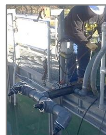
Optional Distribution Manifold